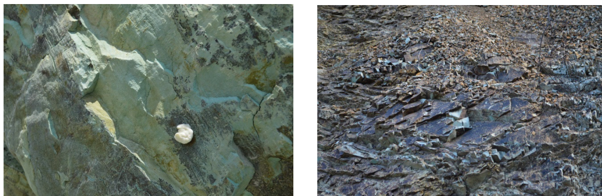
Figure 1. General overview of the investigated volcanic tuff, left – Teișani, right – Malul Alb (original).

The chemical composition of the investigated samples (Table 2) was determined using X-ray fluorescence spectrometry using one gram of each sample, the analysis being carried out in a helium atmosphere according to a protocol recommended by the manufacturer.